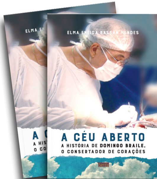
The book cover of his biography.